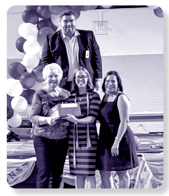
2019 Greenhaw Outstanding Athlete Award

Please check Facebook or look on our website: SunsetAlumni.com